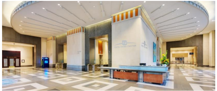
SUITE 1420 1,738 RSF